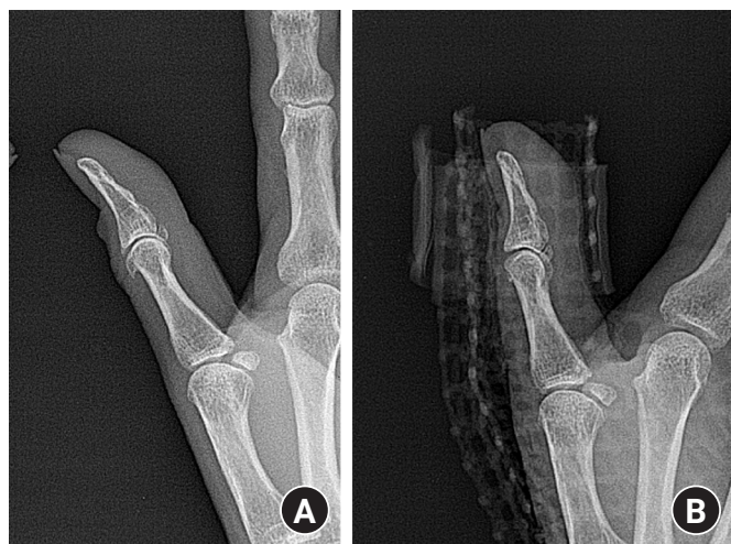
Fig. 2. (A) In this patient, a preoperative X-ray examination showed a prominent distal phalangeal osteophyte. (B) After osteophyte resection, flattening of the distal phalanx was observed.

crosis. In this patient, the bilobed flap for mucoïd cyst resection and DIP joint arthrodesis for severe degenerative osteoarthritis were performed. It may have been caused by flap damage during the osteotomy of the distal phalanx base and middle phalanx head using oscillating saw. During the follow-up period in our cohort, there were no recurrences of the cyst.