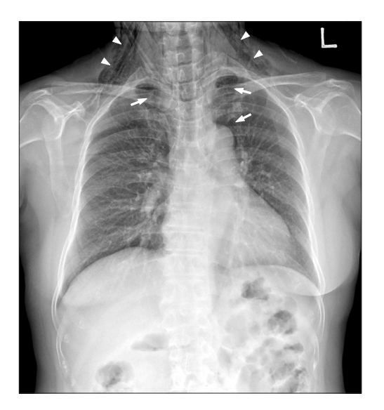
Fig. 1. Anterior-posterior chest radiograph revealed pneumomediastinum (arrows) and subcutaneous emphysema (arrowheads) with streaky radiolucencies.

The patient was admitted to the hospital for treatment of