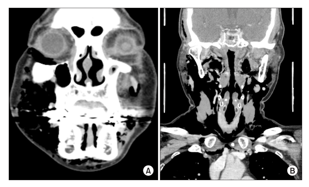
Fig. 2. Diffuse soft tissue emphysema in the masticator space, peripharyngeal space, and superior mediastinum was observed on computed tomography. A. Coronal view at the mental foramen level: the facial emphysema extended into the right orbital cavity. B. Coronal view at the pharyngeal and laryngeal regions: the cervical emphysema was observed in the peripharyngeal space and superior mediastinum.

Another pathway is through the periosteal and submucosal