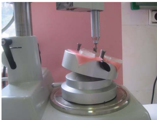
Fig. 1. Perforating the acrylic model.

The acrylic model was placed over the cast and 10 spots indicative of the location of teeth were marked on the acrylic model (4 spots for molar teeth, 2 spots for premolars, 2 spots for canines, and 2 spots for incisors). The marked spots were perforated (Fig. 1) and 10 screws were inserted into the holes in such a way that a few screw threads were above and a few were below the acrylic model (Fig. 2). To ensure the correct positioning of the screws within