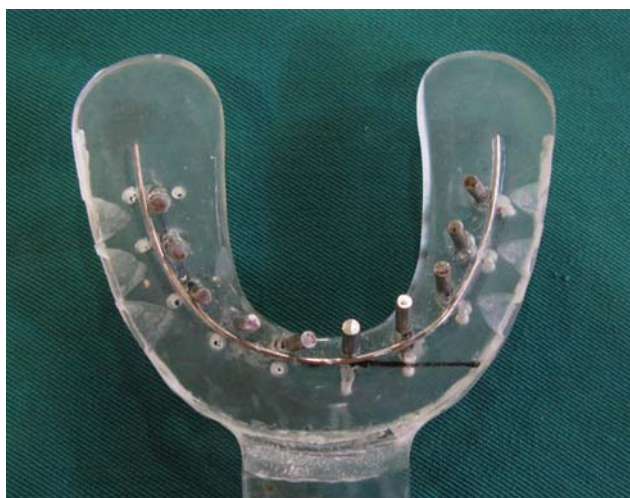
Fig. 2. Acrylic model along with the inserted pins.

the focal trough of the panoramic image, a pilot study was conducted using the first fabricated acrylic model. In the pilot study, several consecutive panoramic radiographs were taken from the model and by changing the location of screws, their accurate location and focal trough were specified.