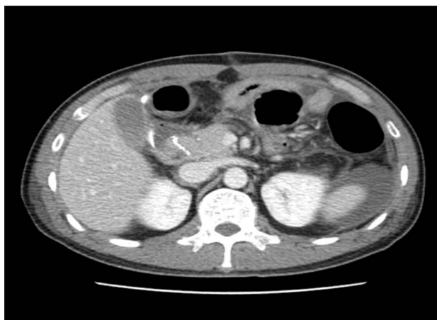
Fig. 1. Abdominal computed tomography scan showing duodenal stump leakage and air pockets suggestive of abscess formation.

Approval for this retrospective study was obtained from the Institutional Review Board of the Seoul St. Mary's Hospital.