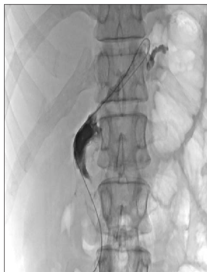
Fig. 2. Fluoroscopy-guided pigtail catheter insertion.

In cases requiring a duodenostomy tube, a Foley catheter was