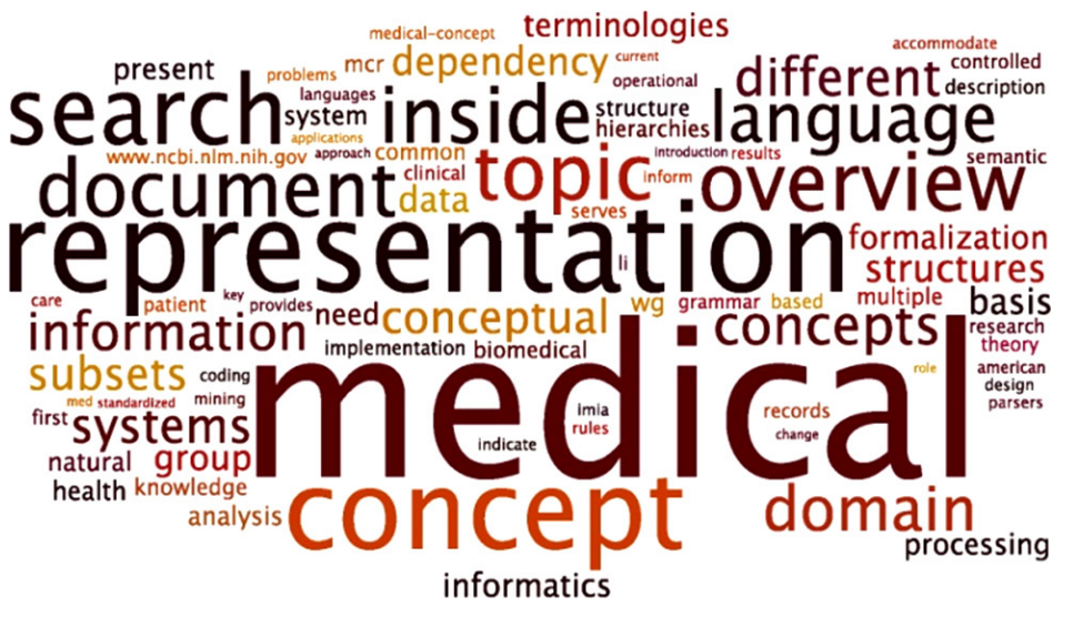
Figure 2. Wordle tag cloud generated from result of catchphrase search using Ultimate Research Assistant [5].

representation" was used mostly in the nineties (Figure 1). Scopus data were available for 1993–2008. The targeted semantic search revealed a wide conceptual domain related to this phrase, as shown in Figure 2.