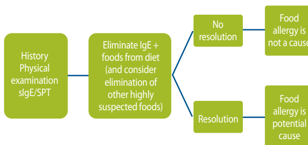
Fig. 1. Diagnosis of food allergy. sIgE, specific immunoglobulin E; SPT, skin prick test.

The diagnosis of food allergy in Indonesia based on careful history taking, physical examination, daily diet records, and SPT or sIgE as a guide to conduct elimination and provocation test (Fig. 1). Interpretation of SPT or sIgE should be done carefully, because positive results of SPT or sIgE only indicate sensitization and it does not always related to clinical symptoms. Provocation test is conducted in an open challenge methods because it is difficult technically to perform provocation test with double-blind