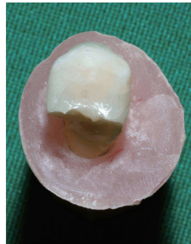
Fig. 3. Mode of unrestorable fracture.

After finishing and polishing the restorations, all specimens were stored in distilled water at 37°C for six months and thermocycled for 1,000 cycles at 5°C and 55°C with a 30-s dwell time according to ISO TR 11454 (1994).