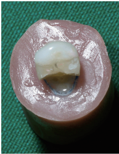
Fig. 2. Mode of restorable fracture.