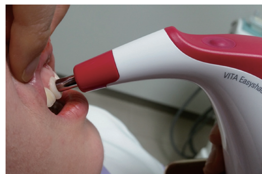
Fig. 1. The Easyshade V determined tooth color with the probe tip placing perpendicular to the tooth surface.

All measurements were performed by a single experienced operator. For every measurement, each device was conducted a white balance on its calibration block. The shade was measured at the central tooth area of labial surface 8,15,17 in “base shade determination” mode with the measuring tip lying flush on the tooth surface to achieve an accurate measurement (Fig. 1). The color measurements were carried out 3 times with an interval of 1 hour for each device. 8,17,20 Thus, a total of 270 readings per each device were obtained. The measurement results could be displayed in the VITA 3D-Master system, VITA classical shade system, VITABLOC shade, or bleach index. In this study, VITA 3D-Master system was used to analyze matching performance of the devices. Shade coordinates were also obtained by clicking 3D-Master shade. The degree of matching to shade guide system was indicated by a green (good), yellow (average), or red bar (adjust). In this study, only “good” matching results were used (Fig. 2).