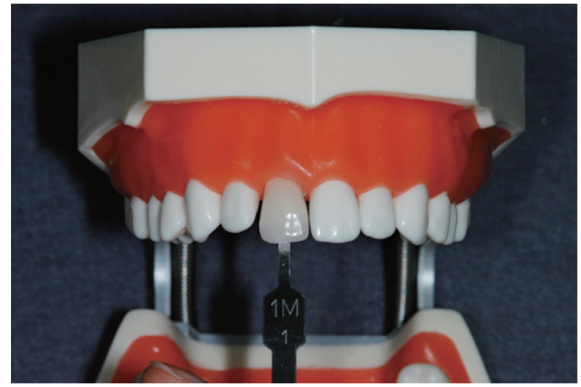
Fig. 3. Each shade tab to be measured was positioned in the dentiform model inside a black box.

To verify the measurement repeatability within devices, the intraclass correlation coefficient (ICC) and 1-way ANOVA followed by Bonferroni multiple comparison for L^* , a^* , and b^* values were analyzed. The ICC was obtained as an average measurement with absolute agreement and a 2-way mixed effect model. For matching reliability within devices, whether or not the obtained shade matched the correct 3D-Master shade tab, intra-device matching agreement rate was calculated.