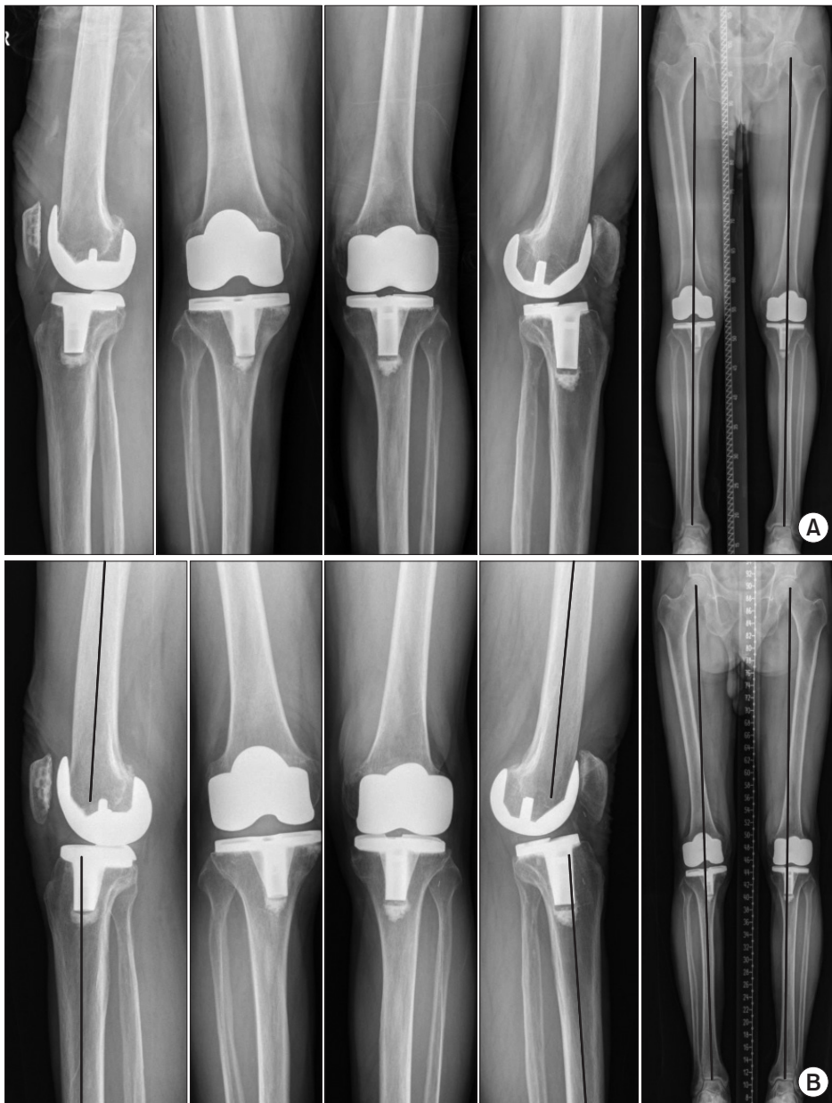
Fig. 1. Postoperative radiographs showing insufficiency due to progressive weakening of the posterior cruciate ligament (PCL) tension. (A) One-year postoperative (right knee) and 14-year postoperative (left knee) radiographs after cruciate-retaining total knee arthroplasty (CR TKA); the sagittal angle of the CR TKA was 0.9^\circ of flexion. (B) Three-year postoperative (right knee) and 17-year postoperative (left knee) radiographs after CR TKA. Gradual insufficiency of the PCL tension caused hyperextension of the left knee although she had no clinical instability symptoms and limited range of motion; the sagittal angle was 10.5^\circ of hyperextension.

In our previous study with NexGen prosthesis, the conversion rates to a PS type femoral component of size C, D, and E were 13.1%, 7.0% and 6.3%, respectively. 10) The conversion rate increased with the use of smaller femoral components in the multivariate analysis ( p = 0.011 ). We attributed these results to morphologic characteristics of