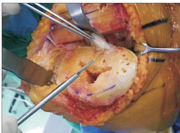
Fig. 3. Posterior cruciate ligament (PCL) recession at the tibial insertion of the PCL during cruciate-retaining total knee arthroplasty for gradual decrease of the PCL tension and gradual increase of the flexion gap.

the tibial slope will reduce tension on the PCL and facilitate flexion in CR TKA. However, surgeons should know that a large slope can injure the insertion of PCL at the tibia, leading to instability in flexion. In addition, the design characteristics of the implant and the inherent slope of polyethylene insert should also be considered when making PSA following the manufacturers' recommendation. 16) In the majority of PS type prostheses, a small tibial PSA is recommended. 20,32) An increase of tibial slope would further increase the flexion gap and the risk of significant instability in flexion in PS TKA. Furthermore, a large slope in PS TKA would lead to impingement of the post-cam mechanism. 32)