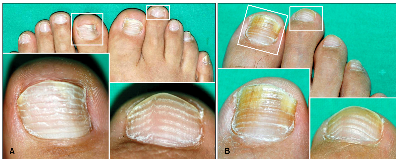
Fig. 2. (A) Both toenails also showed multiple transverse bands, which are alternate layers of Mees' lines and Beau's lines. Both Mees' lines and Beau's lines were more prominent on the toenail plates. (B) After 4 months, he discontinued the chemotherapy and his toenails show a transverse depression that migrates distally as the nail grows.

matrix, which may manifest as multiple Mees' lines or Beau's lines in the nail plate 4 . Mees' lines are signs of toxicity to the distal nail matrix, resulting in parakeratosis of the nail plate, which becomes white and opaque. Drug-induced true leukonychia (Mees' lines) appears as one or several parallel transverse white bands affecting all nails at the same level and moving distally with nail growth 5 . Beau's lines are typical signs of acute toxicity to the nail matrix with transient arrest in nail plate production. The nail shows a transverse depression that migrates distally as the nail grows 5 .