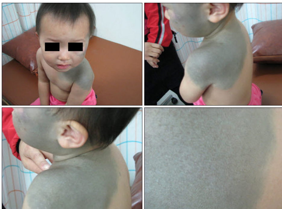
Fig. 1. An extensive amount of uniform deep blue patches were seen to cover the left unilateral side of the face, neck, chest, shoulder, and back.