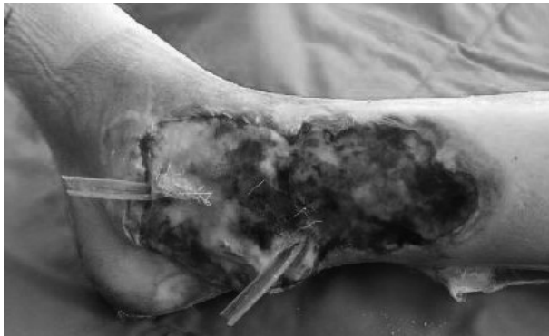
Fig. 2. Pyoderma gangrenosum on the right leg.

mucosa was aspirated and seromucoid aspirate sent for bacterial culture. Bacteria was not identified from the culture. A paranasal sinus CT scan was performed (Fig. 3). Upon examination of the septum deep to mucosa, the majority of septal cartilage was missing due to necrosis, leaving only normal looking cartilage in front of the perpendicular plate of ethmoid and vomer (Fig. 4). The biopsy on the margin of missing septal cartilage was done to determine whether the saddle nose was caused by direct cartilaginous involvement of ulcerative colitis. However, it revealed that there were no signs of granulomatous inflammation. The patient was diagnosed with ulcerative colitis based only on her clinical symptoms and colonoscopic findings. Pyoderma gangrenosum in the leg skin was suspected as an extraintestinal manifestation of ulcerative colitis and that saddle nose deformity resulted from an aseptic nasal septal abscess. Therefore, the patient was placed on corticosteroid therapy and infliximab, a tumor necrosis factor (TNF) antibody. Her nasal dorsum was intermittently observed during the course