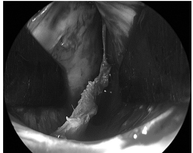
Fig. 4. Nasal endoscopic finding showed missing septal cartilage. There was small amount of remaining cartilage in the perpendicular plate inside the intact septal mucosa.

of medical treatment to determine whether there was any further deformity of her nose. When it was confirmed that there was no further change in her nose in seven months, augmentation rhinoplasty using Tutoplast ® Fascia lata allograft was done. The patient was then followed up for a year after surgery and there was no evidence of recurrence in the nose inside and out.