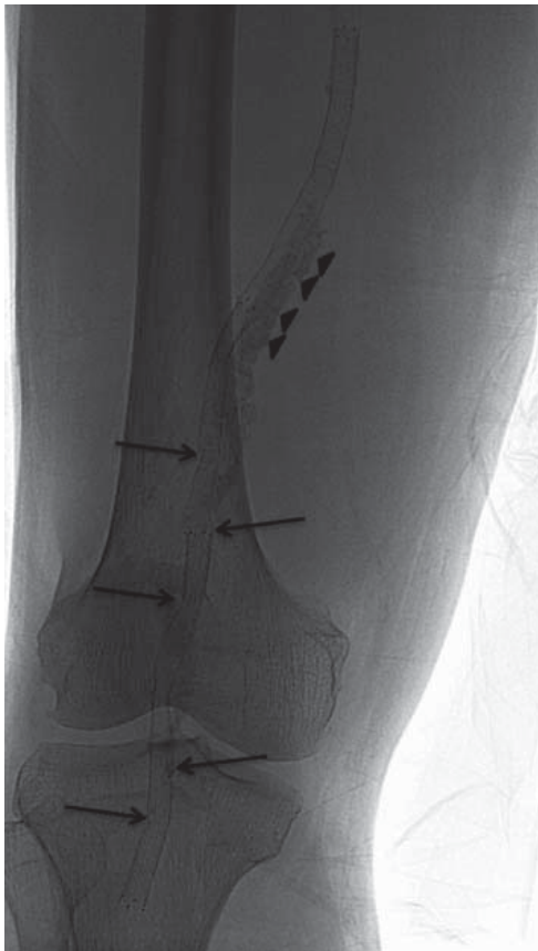
Fig. 3. 87-year-old man had diabetes with resting pain in his right foot. He had chronic total occlusion from mid-superficial femoral artery to popliteal arterial P3 segment with massive calcifications (arrowheads). Therefore, he underwent primary stenting there. However, at 3-month follow-up, his symptoms had recurred and type 2, 3 and 4 fractures (arrows) were detected on fluoroscopy.

complete occlusion of blood flow; however, the cases that underwent stent placement up to the P2 segment included just one case of stent fracture without evidence of stenosis or occlusion. Therefore, the group with stent implantation up to the P3 segment had a higher fracture rate than did the group that was stented up to the P2 segment ( p < 0.05 ). The overall primary patency was 94%, 61% and 44% at 1, 3 and 6 months, respectively (Table 1).