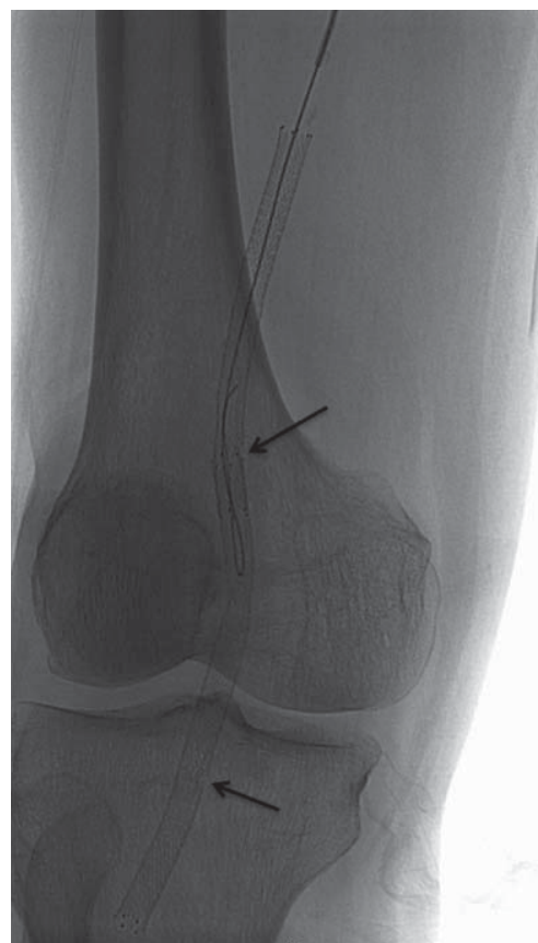
Fig. 2. 74-year-old man had diabetes with resting pain in his right foot. He had chronic total occlusion in distal superficial femoral artery and popliteal artery. He underwent stent placement up to P3 segment for bail-out after failed balloon angioplasty. At 3-month follow-up, his symptoms had recurred and type 2 stent fracture (arrows) was detected on fluoroscopy.