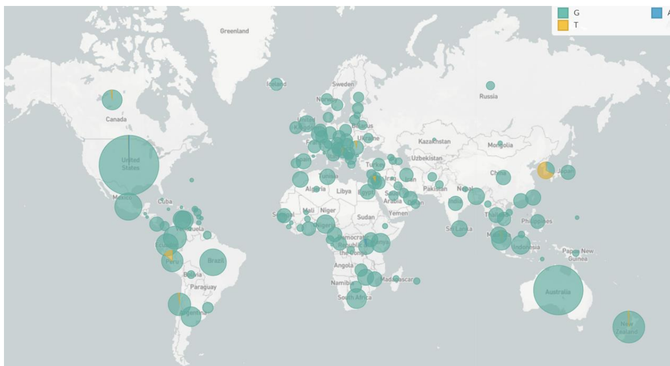
Supplemental Data Fig. 2. Global distribution of the G29179T variant (as of February 28, 2021). The analysis was performed using Nextstrain ( https://nextstrain.org ). Abbreviations: A, adenine; G, guanine; T, thymine.