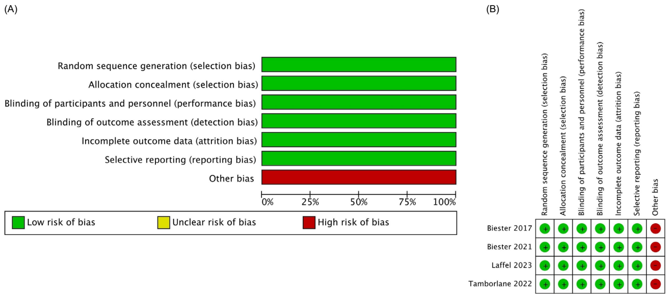
Supplementary Fig. 1. (A) Risk of bias graph: review of authors' judgements about risk of bias item presented as percentages across all included studies. (B) Risk of bias summary: review of authors' judgements about risk of bias for each item for each included study.