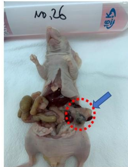
S6 Fig. The application of tissue adhesive in generating orthotopic pancreatic cancer model. (A) Representative IVIS image. (B) Pancreatic ductal adenocarcinoma tumor formed was marked by arrow.