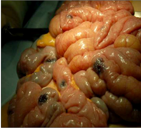
Fig. 5. Multiple transmural venous malformations were found in the small bowel during exploratory laparotomy.