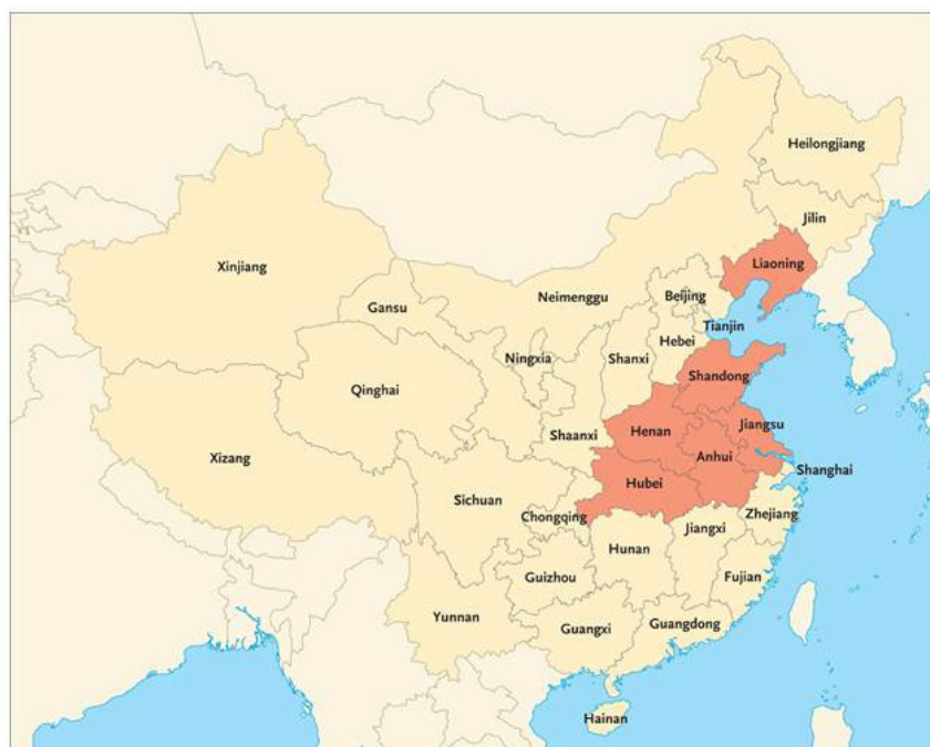
Figure 1. Geographic Distribution of SFTSV in China. Since March 2010, SFTSV was isolated from patients are shown in red. SFTSV has been reported in at least 13 provinces in the central, eastern, and northeastern regions of the People's Republic of China. Most patients are farmers living in wooded, hilly, or mountainous areas, and the epidemic season is from March through November, with the peak incidence usually in June and July (5).

many years, SFTSV is the first phlebovirus isolated in China (Fig. 1) (5). SFTSV RNA was detected in the ixodid tick Haemaphysalis longicornis collected from animals (5). Studies in China between June 2009 and September 2010, detected viral RNA in 10 of 186 (5.4%) H. longicornis collected from domestic animals in areas where SFTSV RNA was also detected in human patients of SFTSV. Consequently H. longicornis has been identified as a possible candidate vector of SFTSV (5).