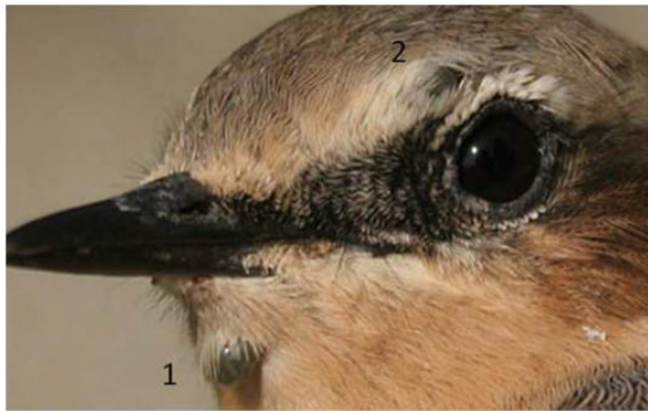
Figure 3. Bird species. Typical feeding sites of Hyalomma marginatum nymphs on an Oenanthe oenanthe (26).

tick species (27). Pre-adult ticks can stay attached to avian host during migration, thereafter detaching at breeding or stopover sites, where mammalian host can potentially establish new foci (2). This is particularly important in the case of H. marginatum that exhibits a two-host cycle with the engorged larva remaining and moulting on the bird to feed again as a nymph. This maximizes the proportion of larvae reaching the adult stage, and also permits long range dispersal on account of the time remaining on the migratory bird.