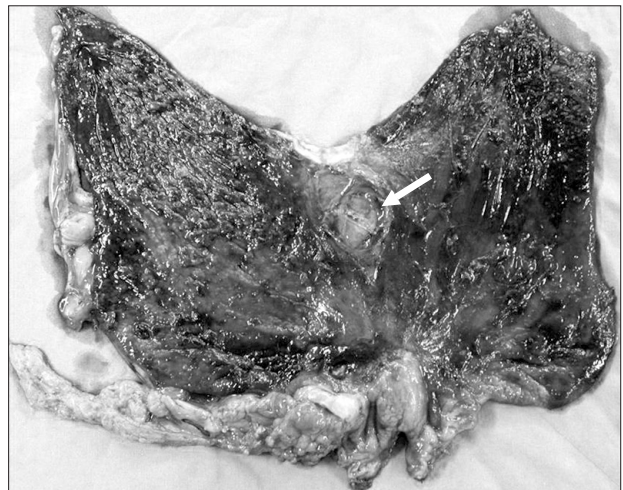
Fig. 3. Finding of the resected stomach. Near total gastric mucosal necrosis and longitudinal dehiscence at lesser curvature side were identified (Arrow = longitudinal dehiscence of the gastric wall at the lesser curvature side).

struction and performed emergency laparotomy. Operative findings revealed that the stomach was massively distended and that a large sludge of the soaked laver was impacted at the antrum when gastrotomy was performed. After the removal of gastric contents, we examined the gastric mucosa. The entire gastric mucosa exhibited generalized edematous changes and easily came off with palpation (Fig. 2). We observed several enlarged lymph nodes around the perigastric area and mild hardness of the antrum; however, there were no obvious findings suggesting gastric cancer despite the severe gastric dilation. We suspected gastric cancer associated with gastric outlet obstruction. However, we did not perform a definitive cancer surgery because of the patient's condition. The patient un-