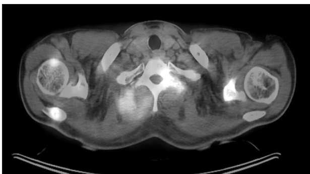
Fig. 2. PET-CT shows increased uptake in the vertebra, paravertebral muscle.