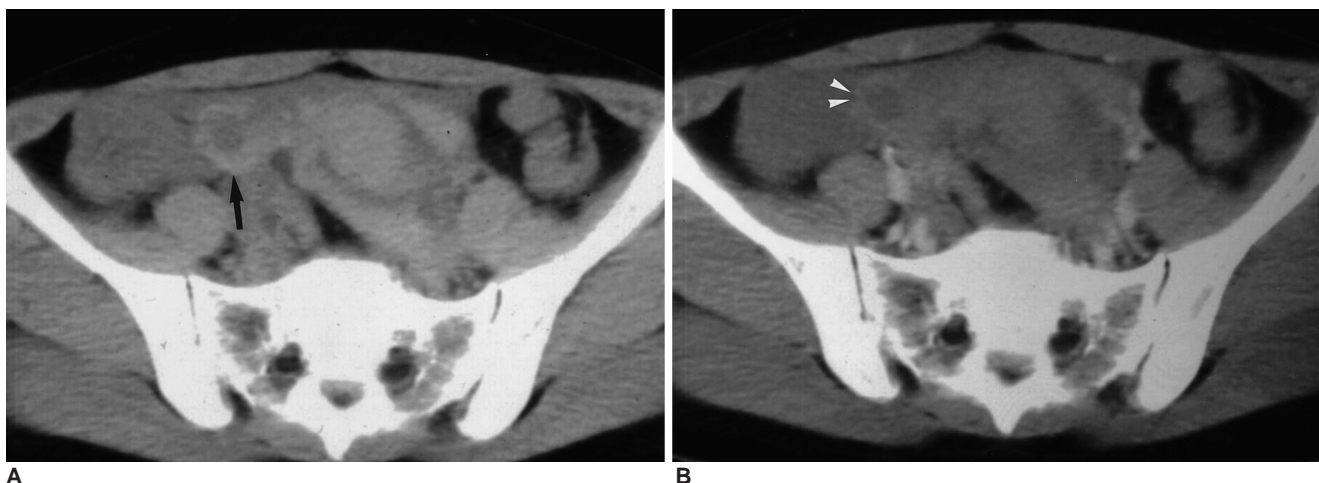
Fig. 3. A 34-year-old woman with lower abdominal pain and anemia.

A. Non-enhanced CT scan of the pelvis shows high-attenuated pelvic fluid, suggesting hemoperitoneum. The right adnexa contains a cystic lesion (arrow).