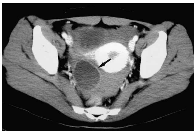
Fig. 4. A 19-year-old woman with severe pelvic pain and a negative pregnancy test. At contrast-enhanced CT, the wall of the cystic mass (arrow) is well enhanced. Note the presence of high-attenuated fluid in the cul-de sac and dependent portion of the cyst.

B. Contrast-enhanced CT shows that the wall of the right adnexal lesion is well enhanced. In the cystic wall, suspicious interruptions (arrowheads) are apparent.