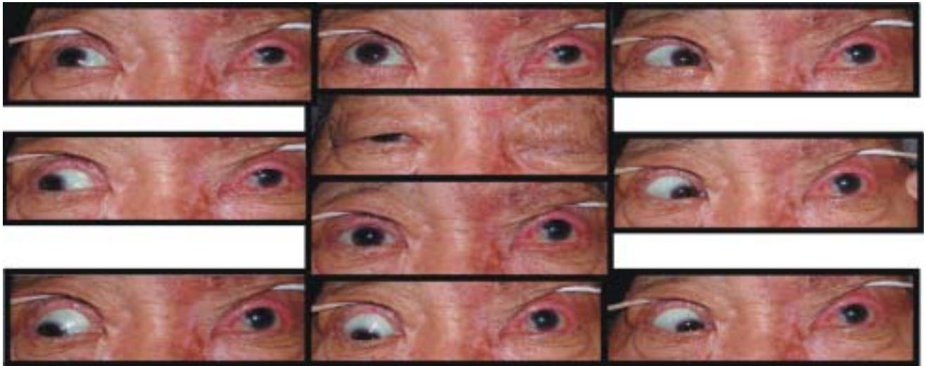
Fig. 2. Nine cardinal directions of ocular movement at an early stage of disease. Left lid drooping and limitation of ocular movement in all nine directions of gaze were noted.

improvement of cutaneous lesions, keratitis, and uveitis. At three months after treatment, the ophthalmoplegia and lid drooping were starting to recover.