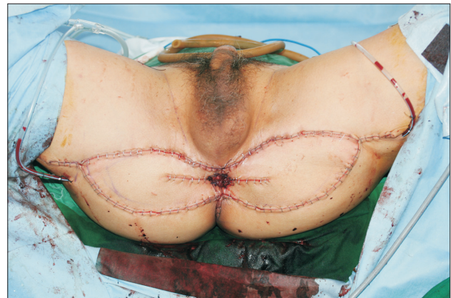
Fig. 3. Immediate postoperative image.