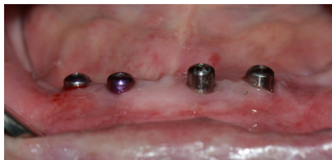
Fig. 3. Placement of the healing abutments in the oral cavity.