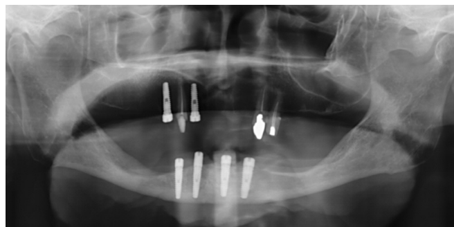
Fig. 1. Panoramic radiograph shows the placement of four implants in the mandible.

length of 11.5 mm were placed in the mandible (Fig. 1). The implants used in this study were external hex implants (ExFeel; Megagen, Daegu, Korea) [1]. After 4 months of healing, a mandibular pick-up implant impression was obtained using an individual tray fabricated on the study cast with minimal relief based on the dynamic impression concept [1].