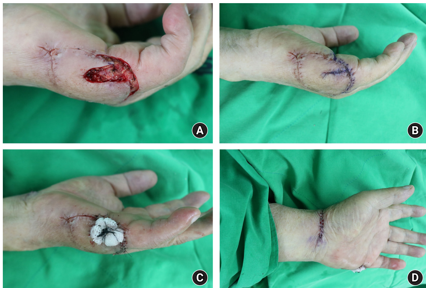
Fig. 2. (A) Previous flap site was identified to be a malignant lesion in the pathology examination. We planned further surgical management with a safety margin of 4 mm. (B) After performing further wide excision of the skin lesions, the defect was observed in the previous area of keystone flap ( \Omega -variant double-arm portion). (C) We used skin graft for coverage of defects to prevent contracture. (D) A postoperative photograph shows the donor site (wrist) in the ipsilateral area.

completed without complications or hand dysfunctions. The patient was satisfied with the outcome after 19-month follow-up, and no cancer recurrence was observed (Fig. 3).