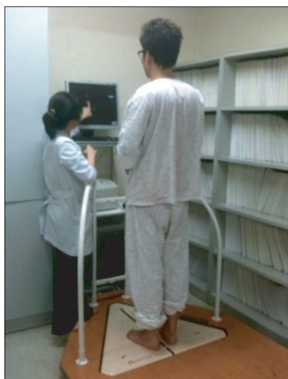
Fig. 1. The Good Balance Evaluator quiet standing balance test.

Subjects removed their shoes and stood on the force plate with feet 10 cm apart at the midline of their heels. They stood at attention looking straight ahead