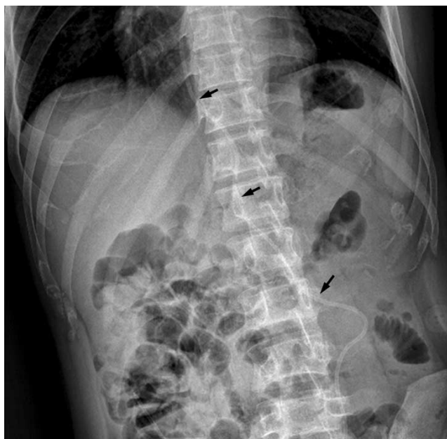
Fig. 1. Abdominal X-ray demonstrating the peritoneal end of the ventriculoperitoneal shunt catheter (arrows).

started on antibiotics. On postoperative day 20, oozing of pus from the abdominal incision site was noted, with wound gapping. Immediate debridement of the wound was done followed by delayed suture. The patient was then referred to our hospital. On admission