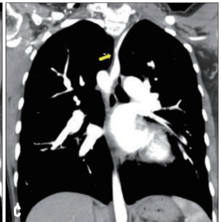
Fig. 4. Chest dynamic computed tomography showed the great vessels originated from the arch in the following order, left common carotid artery (right arrow) (A), right common carotid artery (left arrow) (A), right subclavian artery (B), and aberrant left subclavian artery (C). Left subclavian artery originated from descending aortic arch.