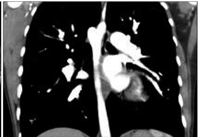
Fig. 3. Chest dynamic computed tomography showed right sided aortic arch (arrow).