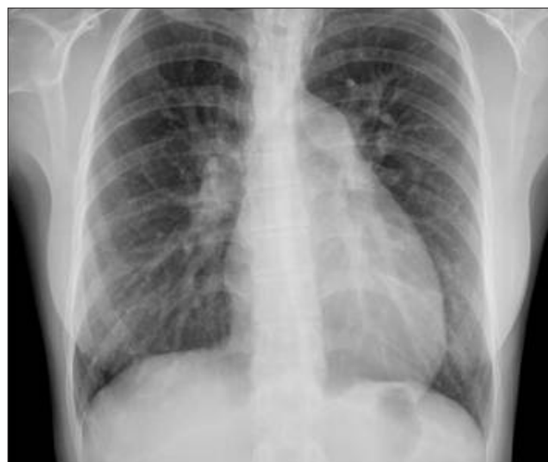
Fig. 1. Chest X-ray showed mild cardiomegaly and increased pulmonary vascularity in both lungs.

ization was 13.25 [systemic artery oxygen saturation (SAO2) = 97%, mixed venous oxygen saturation (MVO2) = 69.5%, pulmonary artery oxygen saturation (PAO2) = 95%, pulmonary vein oxygen saturation (PVO3) = 97%]. A chest dynamic computed tomography (CT) showed right sided aortic arch with aberrant left subclavian artery and enlargement of right