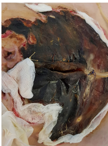
Fig. 1. Massive necrosis of the anterior abdominal wall.

CRP: C-reactive protein, PaO 2 : partial pressure of oxygen, FiO 2 : fraction of inspired oxygen, BNP: brain natriuretic peptide.