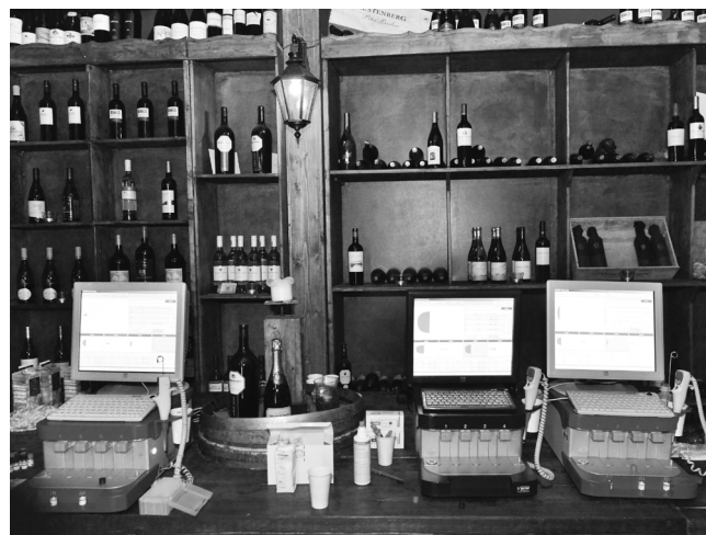
Fig. 1. Point-of-care setup for our study at the department’s Christmas party.

Three blood samples were taken from a cubital vein. Butterfly cannulas (Safety-Multifly-Set®, Sarstedt, Inc., Germany) and several test tubes (S-Monovette® and Citrat-Monovette®, Sarstedt,