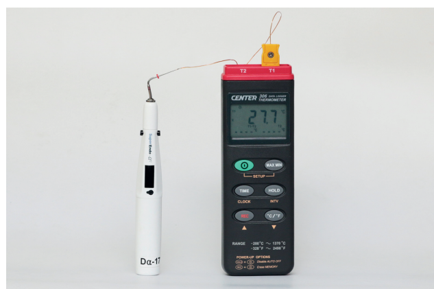
Figure 1. Photograph of a cordless heat plugger connected to a K-type thermometer by a customized copper sleeve.

Pluggers with similar tip sizes and different tapers were used with 3 cordless heat carriers: size 55/(0.06, 0.08, and 0.10) for SuperEndo- \alpha^2 (SE; B & L Biotech, Ansan, Korea), and size 50/(0.06, 0.08, and 0.10) for Friendo (FE; DXM Co., Ltd., Goyang, Korea) and Dia-Pen (DP; DiaDent, Cheongju, Korea). Three pluggers, of size 50/(0.06, 0.08, and 0.10), for SB were used as controls. The pluggers were connected to the heat carriers and firmly positioned with a laboratory vise fixed to a table. For temperature measurements, customized copper sleeves were fabricated to cover 1 mm of each plugger tip and connected to a K-type thermometer (Center 306, Center Technology, Taipei, Taiwan, Figure 1 ). The electric heat carriers were fully charged, and the temperature was set at 200°C for SE, at medium temperature mode (200°C) for DP and FE, and at 200°C with a power level of 10 for SB. The pluggers were heated for 10 seconds, and the temperature was recorded for 15 seconds using a thermometer