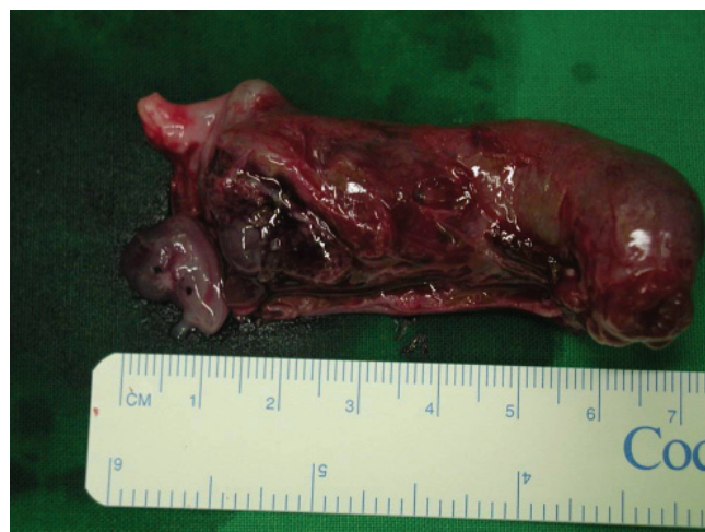
Fig. 3. After right salpingectomy, tubal embryo was confirmed by incision of mass.

rump length (Fig. 1A) and an extra-uterine right adnexal embryo with cardiac activity corresponding to 7 weeks of gestation (Fig. 1B). Also, accumulation of fluid was noted in the Pouch of Douglas. Her hemoglobin was 9.1 g/dL with a normal white blood cell count and platelet count. Serum \beta -human chorionic gonadotropin (hCG) was 17,036 mIU/mL.