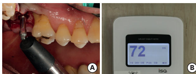
Figure 2. Clinical photography of measurement of implant stability. (A) After attaching a magnetic peg to the fixture, the Osstell® Mentor was used to measure the ISQ. (B) The ISQ value was visible on the screen of the device. ISQ: implant stability quotient.

were instructed to use a 0.12% chlorhexidine gluconate solution (Hexamedin®, Bukwang Pharmaceutical Co. Ltd., Seoul, Korea), until the sutures were removed. The sutures were removed on postoperative day 7. All patients showed good postoperative healing.