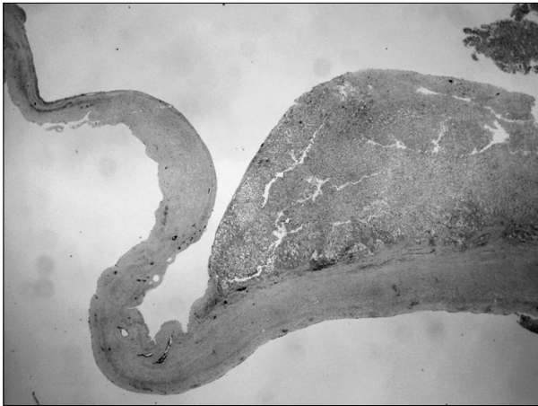
Fig. 3. Scanning of the cyst with low magnification reveals a portion of solid growth. The cyst wall contains a smooth muscle layer and the internal surface is focally lined by cuboidal to columnar epithelium (Hematoxylin-Eosin, original magnification \times 10 ).

cytology was done. There was minimal intraoperative spillage. The patient had an uncomplicated post-operative course.