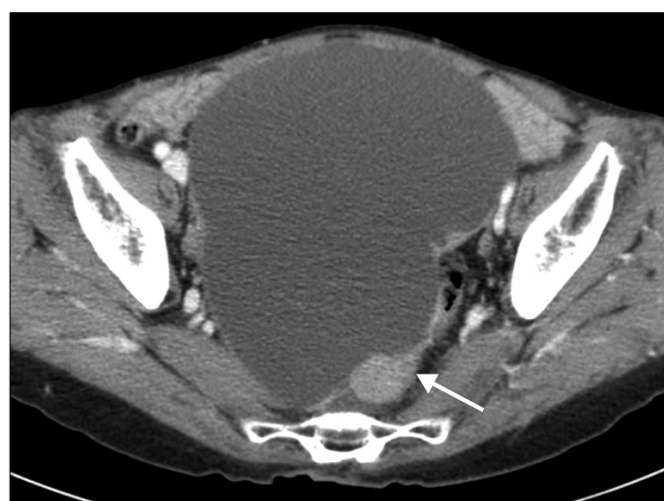
Fig. 1. Computed tomography shows 16 cm sized huge cystic mass with small solid portion (arrow) in the pelvic cavity.

At the time of surgery, the pelvic mass was a cystic lesion adhesive to the right salpinx, uterine fundus, rectum and right retroperitoneum. Cyst surface was clear and well margined with serous fluid inside. Uterus was bicornuate shaped and both adnexae were grossly free. There was no suspicious malignant lesions in the pelvis by inspection and palpation. Under the impression of a paraovarian cyst, cyst excision and washing