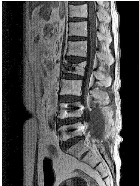
Fig. 3. MRI findings for the lumbar spine (sagittal Gd-enhanced T1): Fluid collection at the laminectomy site and around the fixators.