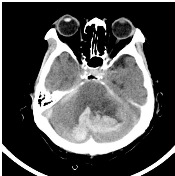
Fig. 4. CT findings for the brain: Acute cerebellar hemorrhage with diffuse parenchymal swelling in both cerebellar hemispheres.

mg/dl), reduced CSF glucose/ blood glucose ratio (29/144). Based on the imaging study results and laboratory results, meningitis was suspected and the patient was admitted to the intensive care unit (ICU) then antibiotic therapy was commenced. CSF culture was requested but there was no growth. On the following day of the admission, incision & drainage was performed to drain the fluid in the lumbosacral region and a drain was inserted. Fluid culture was requested with the drainage but there was no growth. After the treatment, the level of consciousness and symptoms seemed to improve but dyspnea was developed and he became comatose on the 54 th day after the surgery (the 11 th day of re-admission). Brain CT showed cerebellar edema and hemorrhage (Fig. 4). External ventricular derivation was performed as an emergency operation for decompression and he was cared in the ICU. However, his vital signs were unstable and he remained comatose and finally expired after 23 days after the operation.