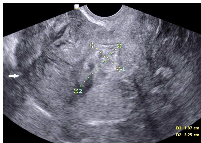
Fig. 1. Ultrasonography image of invisible gestational sac within intrauterine cavity. The arrow showed disconnected myometrial layer and broken myometrium. The heterogeneous lesion measures about 3.3×1.9 cm in size, presumed ongoing hematoma due to perforated uterus.

As the number of women undergoing myomectomy has increased in recent years following treatment for infertility and increased the average maternal age at childbirth, the number of