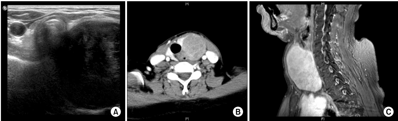
Fig. 1. Preoperative imaging study. (A) Preoperative ultrasonography depicted a well-defined solid, hypoechoic mass in the inferior portion of the left thyroid. (B, C) CT and MR images showed an 8 cm sized solid mass in the left visceral neck space from the upper margin of the C6 spine to the lower margin of the T3 spine that mass abutted the trachea and the esophagus without invasion.