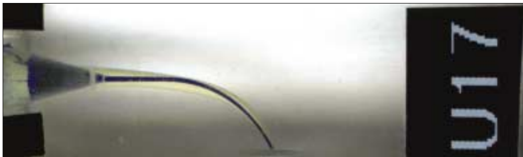
Figure 1. Sample of superimposed image (ProTaper Universal). Purple: Pre-instrumented canal, Yellow: Post-instrumented canal

The centering ratio was to evaluate the movement of root canal center after preparation; the smaller the ratio, the better the instrument remained centered in the canal [11,21,22] . The ratio was computed using the following method: the absolute value of a net transportation (difference