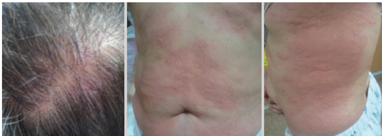
Fig. 1. Variable-sized hives involving the scalp and trunk.