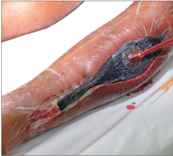
Fig. 3. Postoperative photograph of the left leg demonstrating closure with a vacuum-assisted closure device.

rior compartment, was removed. Next, an incision was made over the anterior compartment; it exposed viable musculature that was reactive to electrocautery; therefore, no debridement was performed. Vertical mattress stitches were used to distally close the skin and cover the peroneal nerve. Proximally, the incision was left open and a KCI V.A.C. Ultra Negative Pressure Wound Therapy System device (San Antonio, TX, USA) was applied with a pressure of 125 mmHg on “continuous” mode (Fig. 3).