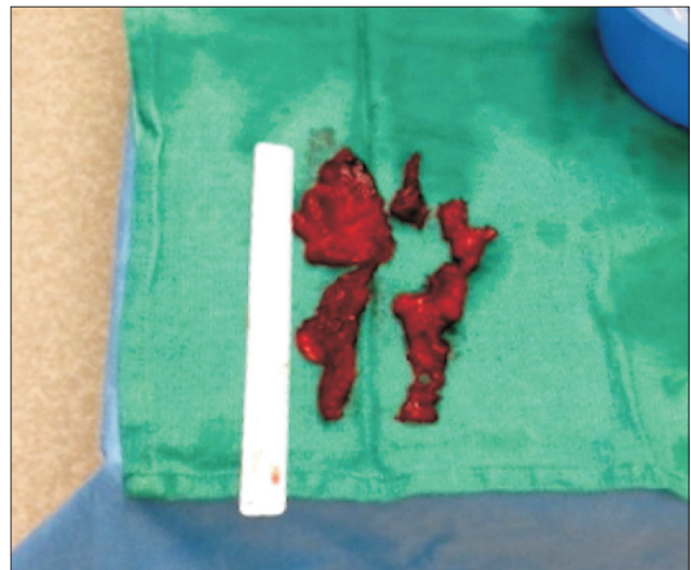
Fig. 2. Intraoperative photograph of the debrided peroneus longus muscle tissue.