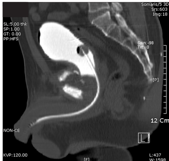
Fig. 4. CT cystogram shows no contrast connections from the bladder to the abscess of the pubis and thigh.