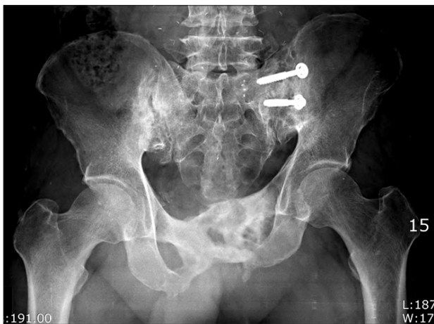
Fig. 2. Initial anteroposterior radiograph of the pelvis.

showed no communication between the bladder and abscess. A computed tomography (CT) cystogram revealed an abscess containing air densities within the bony defect of the deformed pubic ramus. There were no contrast connections from the bladder to the abscess of the pubis and thigh (Fig. 4).