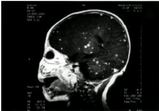
Fig. 3. Multiple enhanced nodular lesions were scattered at the area of gray-white matter junction, cerebellum, pons, medulla, upper cervical spine, mid-brain, thalamus, basal ganglia and internal capsule on sagittal view of MRI, done at the 14th hospital day.

. 7 10 . 12 가 가 가 , 14 (Fig. 3). 29 isoniazid rifampin 12 , pyrazina- mide 2 streptomycin 1 2 (prednisolone) (2 prednisolone 1mg/kg , 2 ) 1 (Fig. 1B) (Fig. 2B)