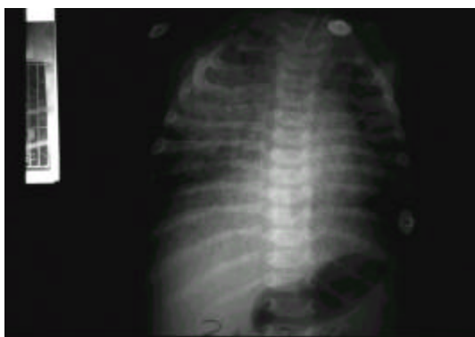
Fig. 1A. Disseminated multiple nodular or confluent opacities like snow flakes were scattered on both lung fields.

( ) : (Fig. 1A), , (Fig. 2A). : 4L/ PaO 2 71 50mmHg 2 , manitol