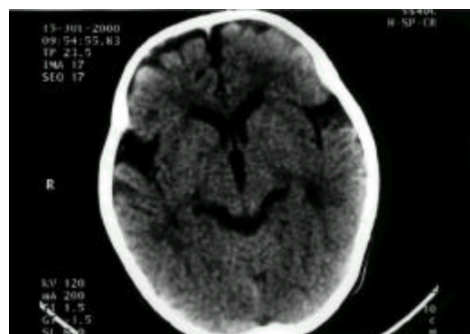
Fig. 2B. Follow up brain CT after clinical improvement. Markedly decreased size and extent of the enhancing nodules on posterior limb of right internal capsule, left portion of the mid-brain both supraventricular gray-white matter junction were seen.