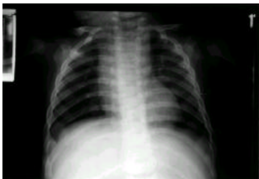
Fig. 1B. Follow up chest radiogram after clinical improvement. Miliary infiltrations were markedly regressed and disappeared on both lungs.

AFB isoniazid, rifampin, pyrazinamide, streptomycin (prednisolon 1mg/kg/day) (Fig. 3 가 가 가 가 가