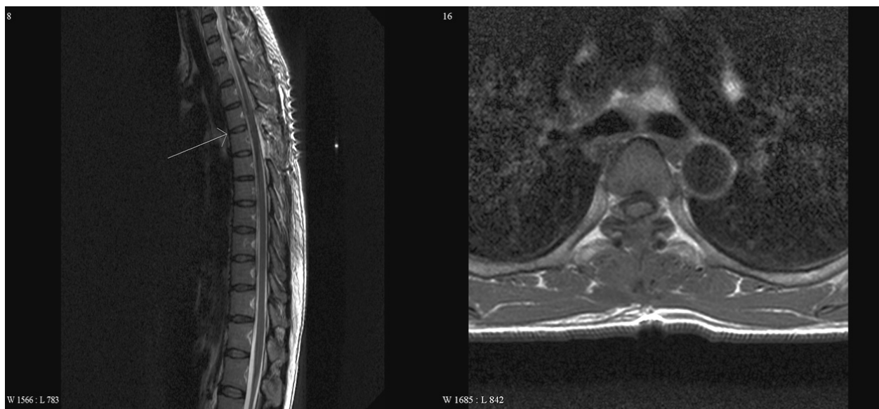
Figure 2. Spine MRI performed 3 days after surgery showing restored spinal cord contour at the level of the T4-5 disc (arrow).

symmetric and intact on both sides. Anal tone was preserved. Cerebellar function test was unremarkable. She showed a mild limping gait in the left side, and her neck was supple.