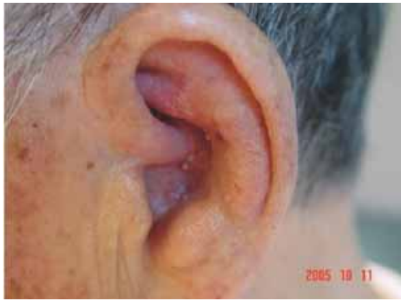
Figure 1. An erythematous-based vesicular rash on the left ear.

experienced one episode of vomiting, after which his anticancer medication was stopped. On his visit to the outpatient clinic 2 days thereafter he showed no focal neurologic deficit other than an unsteady gait. On the evening of the same day, he noticed left peripheral facial palsy. A brain magnetic resonance imaging (MRI) scan was performed on the next day on his visit to the emergency room, and was interpreted to be normal (Fig. 2-A and B). On admission, the patient developed fever and worsening unsteady gait. He had no known past history of chicken pox.