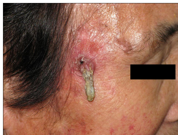
Fig. 1. A 3 × 3 cm sized erythematous patch with a central 1 × 1 cm sized hypertrophic nodule on the right temple. A yellowish-white colored cylindrical horn with a base diameter of 0.7 cm and a height of 2.7 cm arose from the central nodule.

On physical examination, she had a 3 × 3 cm area of an erythematous patch with a central 1 × 1 cm sized hypertrophic nodule on her right temple. A yellowish-white colored cylindrical horn with a base diameter of 0.7 cm and a height of 2.7 cm arose from the central nodule (Fig.