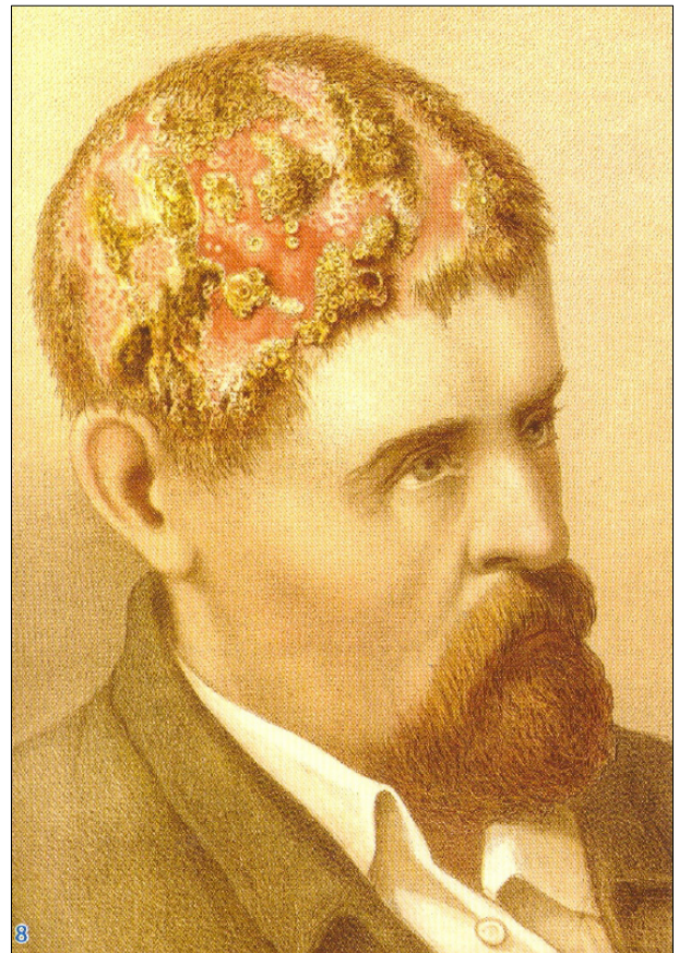
Fig. 2. An illustration Tinea favosa from the: Atlas of skin diseases by Louis Adolphus Duhring . Lippincott, Philadelphia, 1876 (from 'PANTHEON DER DERMATOLOGIE' with permission).