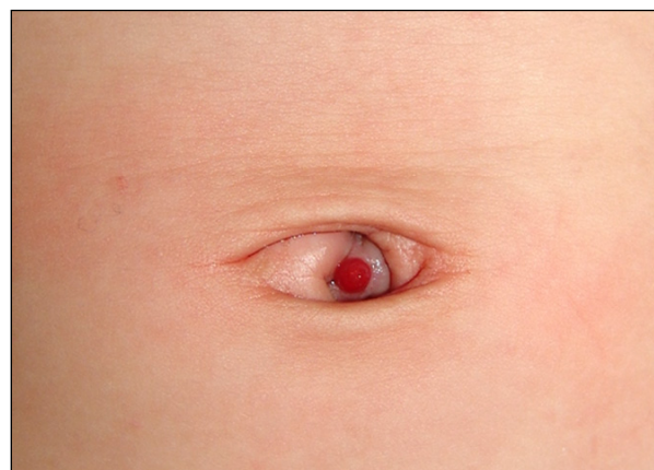
Fig. 1. Pea-sized reddish papule in the umbilicus.

With a presumed diagnosis of an umbilical granuloma or urachal duct remnant, the patient had received abdominal computed tomography which demonstrated no anomaly. We therefore performed a wide excision of the lesion. Microscopic examination of the excised skin lesion showed a polypoid lesion which was composed of well-developed chief cells, parietal cells, and dilated mucous glands (Fig. 2). Heterotopic gastric mucosa was diagnosed. The patient