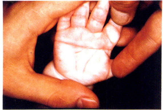
Fig. 3. Simian crease.