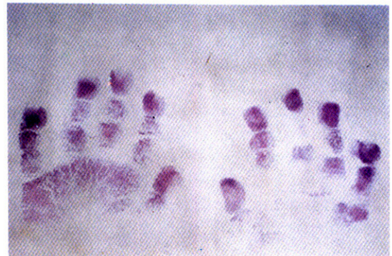
Fig. 4. A dermatoglyphics on both hands.