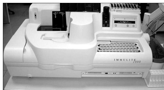
Fig 1. Immunoassay analyzer used in the study.

Normality of the data was assessed using the Kolmogorov-Smirnov test, and statistical homogeneity was checked by the Levene test. A paired sample t-test for within-group changes was used. A one-way ANOVA was applied for the between-groups comparison, while Dunnett's test and Tukey's HSD test were used for the between-groups multiple comparisons. All data were analyzed using SPSS version 15.0 (SPSS Inc., Chicago, IL, USA). A p value of 0.05 was con-