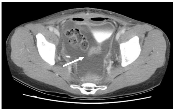
Fig. 2. Ascites. Computed tomography shows abundant ascites in abdominal cavity on 11th postoperative day.

Intraabdominal and retroperitoneal fluid collections following gynecological operations have been frequently reported. These may be detected several days or months after the operation but are generally detected within 1 week postoperatively. 2 The most frequent cause of postoperative ascites is urine leakage from intraoperative injuries to the urinary tract. In this patient, we examined the possibility of a urinary injury by laboratory investigations of the ascitic fluid (the difference in the BUN and creatinine levels between urine and ascitic fluid), intravenous pyelography, and computed tomography; however, we were unable to obtain evidence of such an injury. Therefore, the possibility of lymphatic